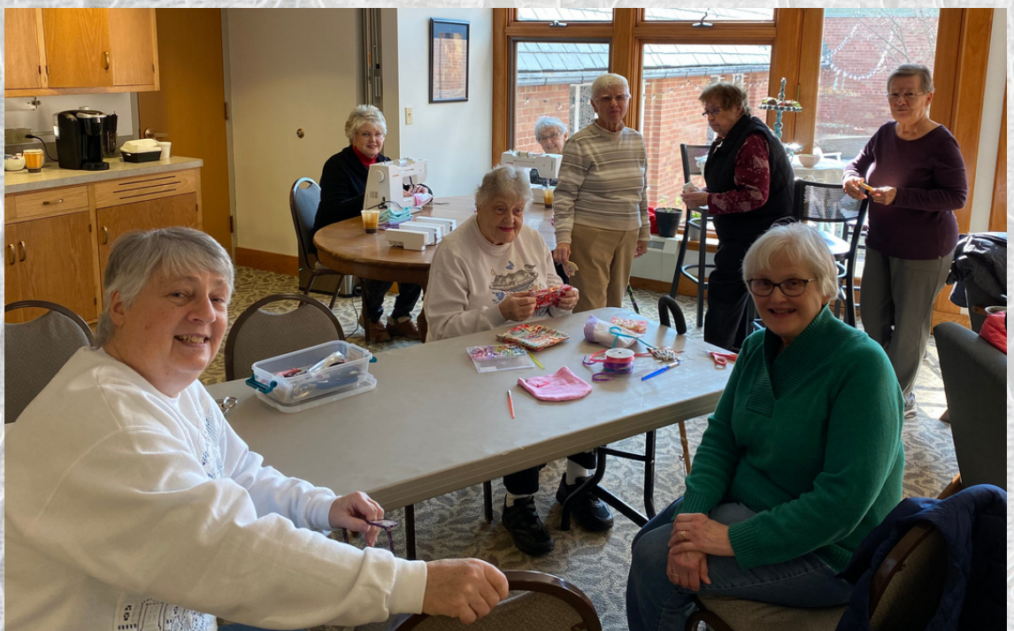
A few of the Creative Ministry team hard at work!