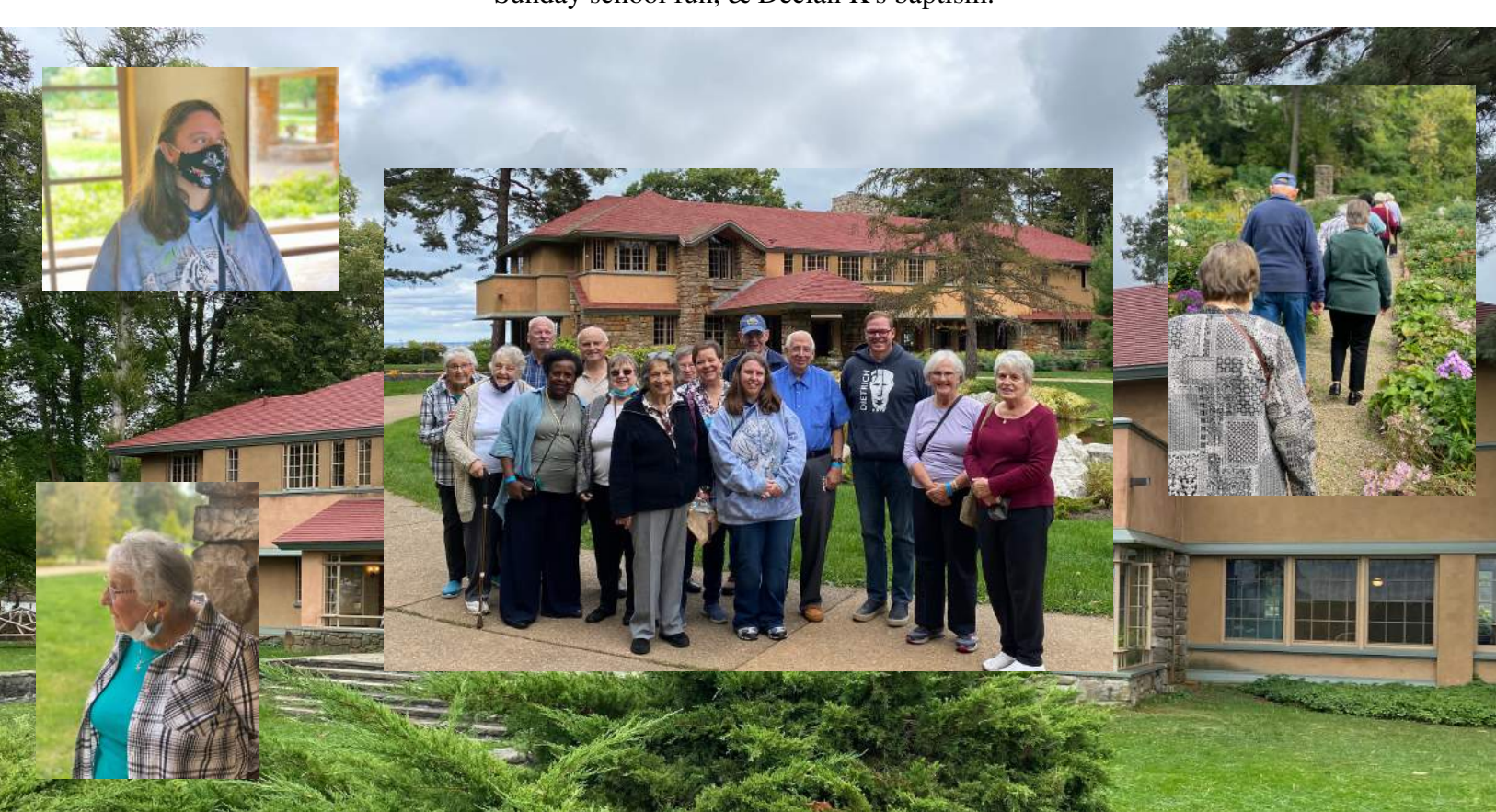
pictured above: fellowship at graycliff